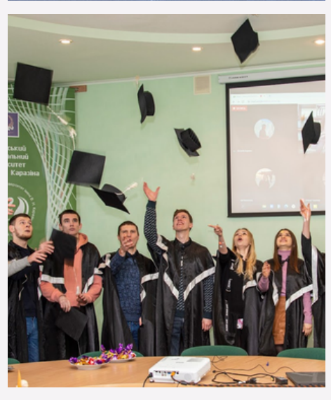
Official languages: Ukrainian, English